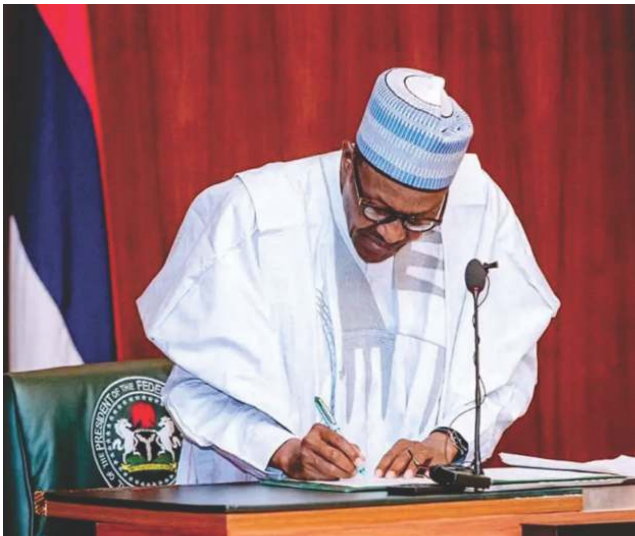
President Muhammadu Buhari signing the BOFI Act Amended

In a bid to strengthen the regulatory and supervisory framework of the Central Bank of Nigeria (CBN) in its functions within the financial industry, the Banks and Other Financial Institutions (BOFI) Act 2020 has been assented to by President Muhammadu Buhari.