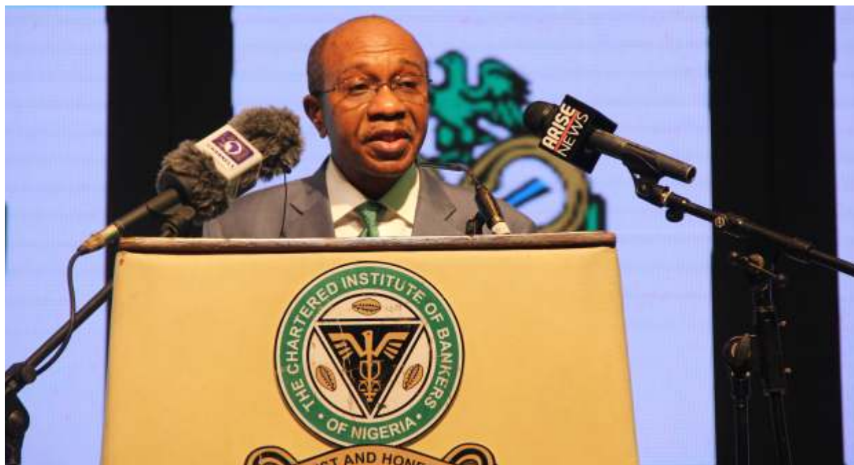
Godwin Emefiele, Governor, Central Bank of Nigeria

The fiscal and monetary authorities in the country have taken unprecedented measures to prevent any long-term damage to the growth prospects of Nigeria's economy. This was effected by stimulating economic activities through targeted interventions in critical sectors such as agriculture, manufacturing, electricity and construction.